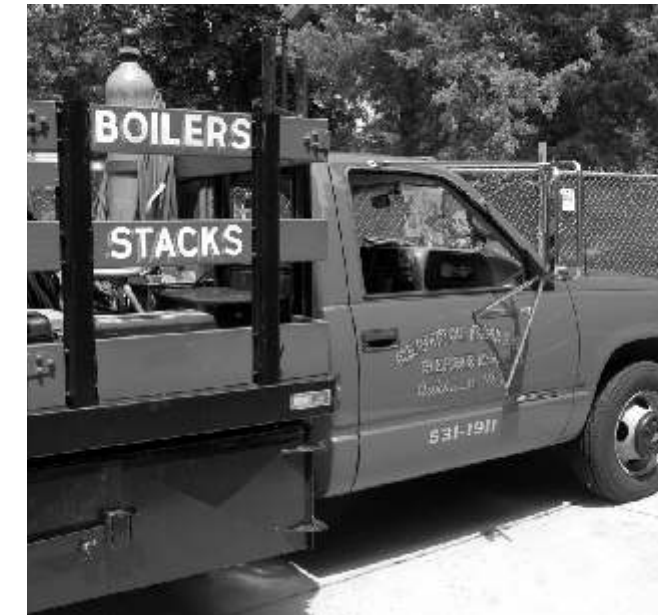
Central Boiler Repair Company of Oakhurst working on campus this summer.

Monmouth University hires over 300 local businesses each year for many projects on campus such as construction, electrical work, paving, recycling, brick laying, mechanical repair, and tree service. Thank you to our neighborhood businesses for their work throughout the year.