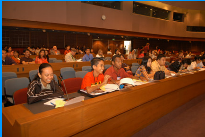
Young participants at East Asia & Pacific Regional Consultation