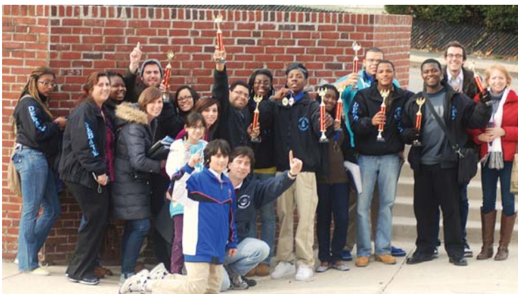
The Asbury Park High School Debate Team proudly displaying their trophies after their win in Baltimore