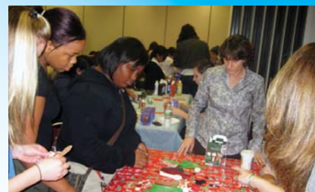
Project BAM session on Holidays Around the World

workshops designed to reach out to the community and engage students in exploring opportunities for higher education through a learning experience based on mentorship and friendship.