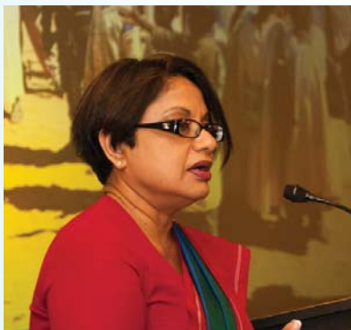
USG Coomaraswamy speaking in Wilson Hall

Monmouth University, through IGU, hosted the inaugural lecture in the annual United Nations Academic Impact (UNAI) Lecture Series this fall, featuring Under-Secretary-General Radhika Coomaraswamy, Special Representative of the Secretary-General for Children and Armed Conflict. A highlight of the lecture was