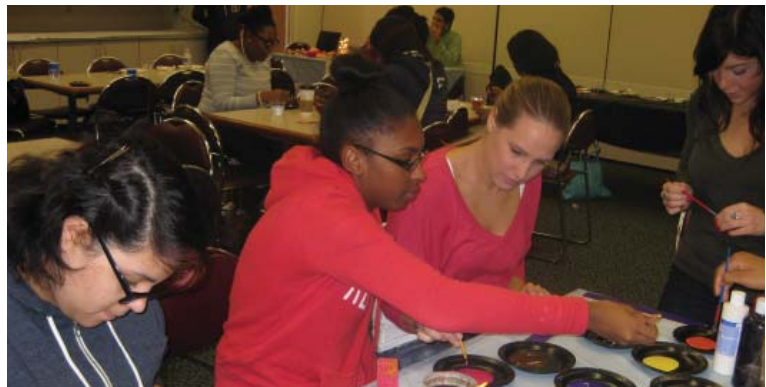
Project BAM Holidays Around the World session