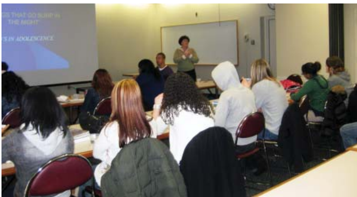
Project BAM Careers in Healthcare session

Project BAM is part of the United Nations Academic Impact (UNAI) initiative. IGU's partnership with UNAI enables the Institute to promote and align its projects with the UN to enhance educational opportunities, human rights, and intercultural exchanges in local and global communities.