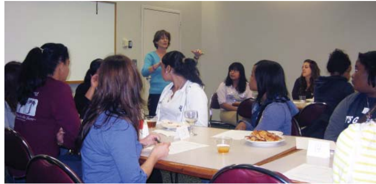
Project BAM Kickoff session