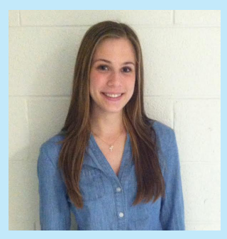
Erin are always available if we need anything."