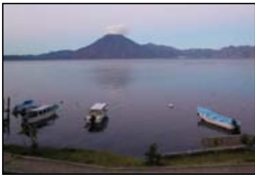
Lake Atlan from Panajachel, one of the spots that the students visited in Guatemala.

For the trip, we worked with an organization called Salud y Paz. This organization provides healthcare, health education, and dental care for communities that normally would not get any of this help. On the property, they also have a preschool for first-grade students. Our mission on this trip was to help with the addition of a second floor of a building to provide rooms to house patients when surgical teams come into the clinic. The