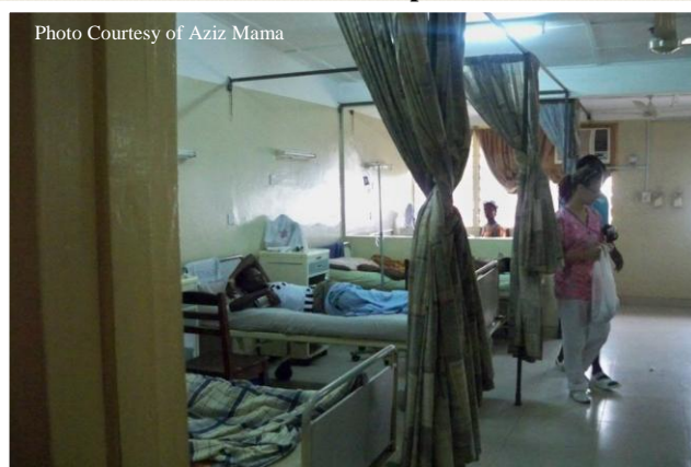
Picture below is the KNUST Hospital in Kumasi, Ghana.