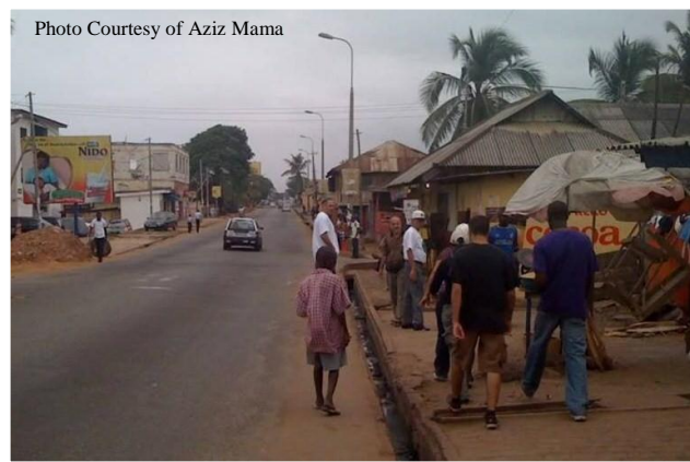
Pictured above are the streets of Kumasi, Ghana .