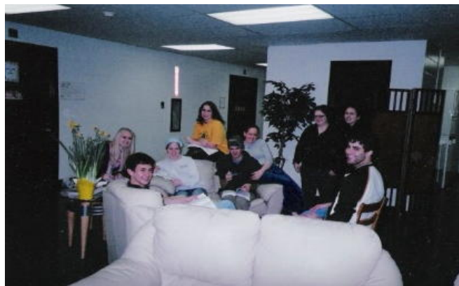
Birch Hall Class of 2005