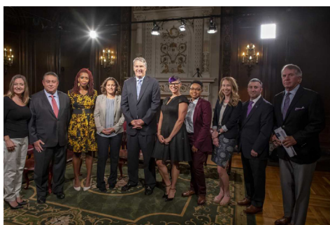
Group photo from the conversation part of the event.

The Conversation and Action series explored a range of social and policy issues related to gender inequality. This two-day event included dynamic discussion featuring divergent and diverse perspectives on a timely topic of interest to feminist scholars and activists. This was followed by an all-day student workshop that