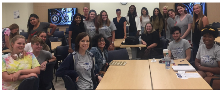
MU Conversation and Action student organizers.