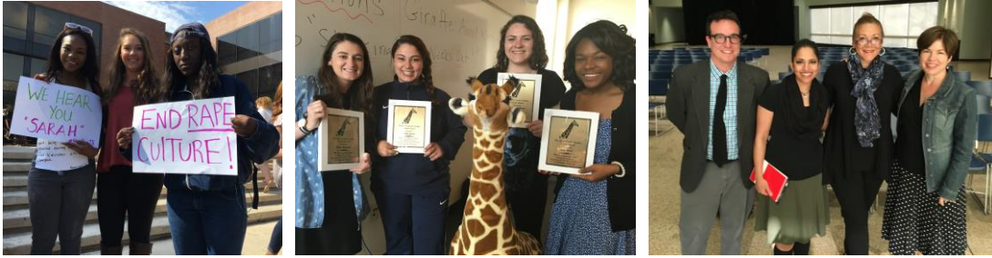
From left: MU protest against sexual assault, Spring 2016; MU Faculty with Michelle Norris of the Race Card Project, Spring 2016; CommWorks student leaders who won the Giraffe Award, 2016; Entire group of Giraffe award winners, 2016