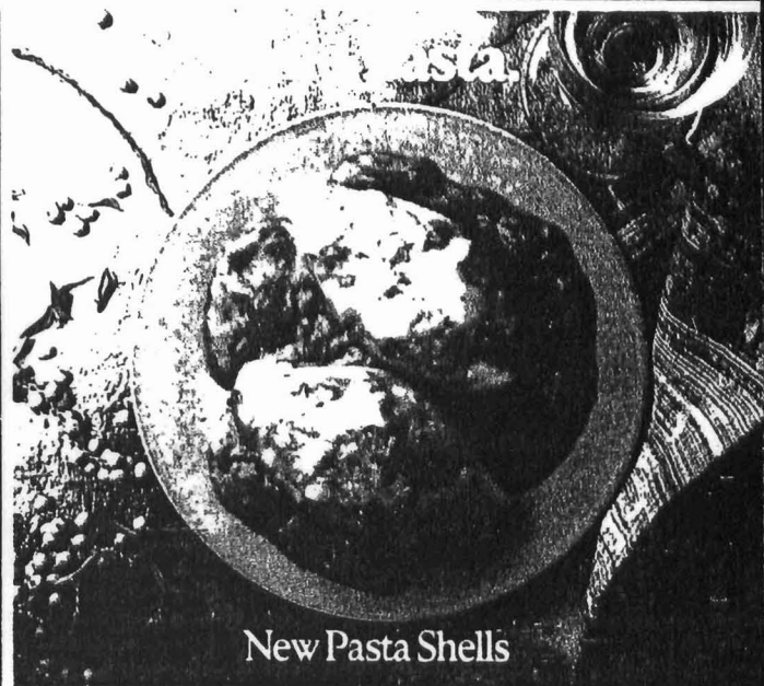
New Pasta Shells