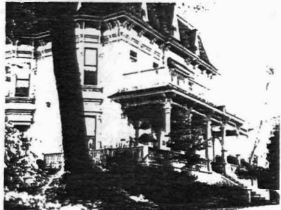
Madrona Manor, Sonoma County, CA.

To find inspiration for new Country Inn™ Brand Rice Dishes, Uncle Ben's went