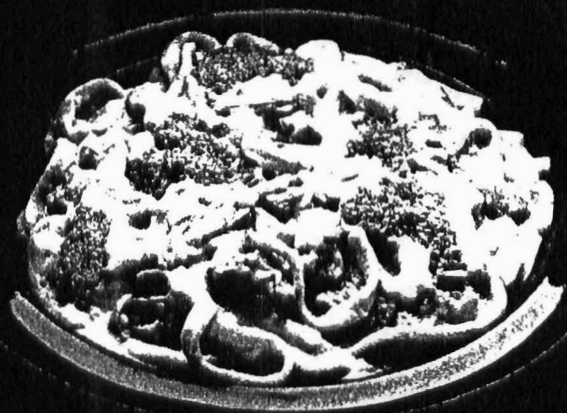
Tuna Noodle Casserole. About 99¢.