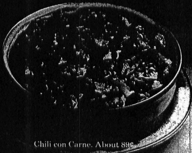
Chili con Carne. About 89¢.