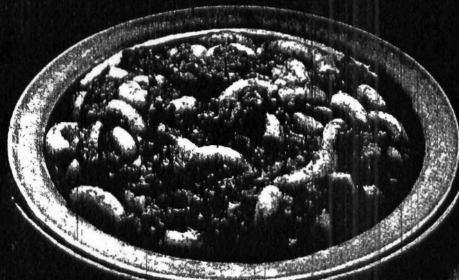
Macaroni and Beef with Tomatoes. About 99¢.