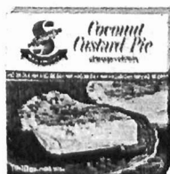
In 2-lb., 12-oz. Golden deluxe, and 1-lb., 10-oz. regular sizes.