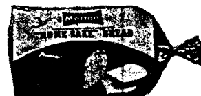
FROZEN DOUGH FOR BREAD & ROLLS