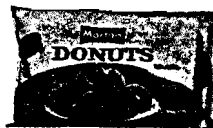
DONUTS & HONEY BUNS