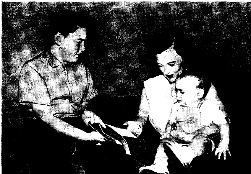
Prize-winning cook also collects stamps