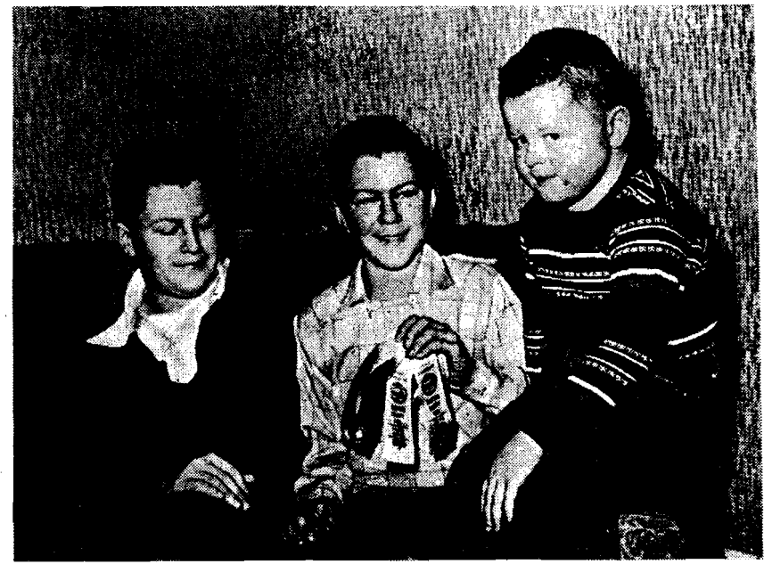
Thirteen-year-old wins cooking competition for second year

This advertisement appears in 1-4 Page The Farmer—October 19, 1957 P. O. 5444