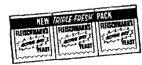
Another Fine Product of Standard Brands Inc.

Crisp fall days call for yeast-raised specialties. And you'll find them easier to serve when you have Fleischmann's Active Dry Yeast on your shelf. This dry yeast keeps for months—always ready. And it's easy to dissolve. Just remember to use warm . . . not hot . . . water. When you bake at home use Fleischmann's Active Dry Yeast as prize-winning cooks do. And try the "Yeast-Riz" Main Dishes. There's a recipe on every "Thrifty Three."