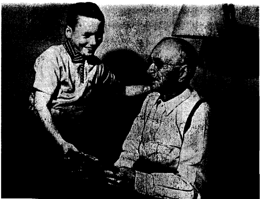
Cooking has been his hobby since age nine