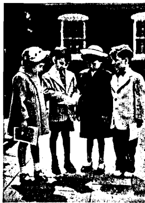
"Suffer the little children —"

This isn't so much Christmas as a grandmother story: about the little girl who went to Sunday school for the first time. When her mother asked