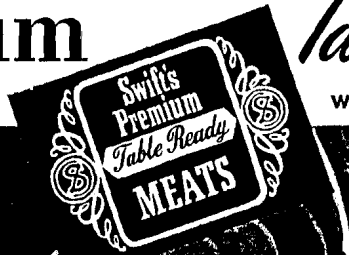
Table Ready Meats