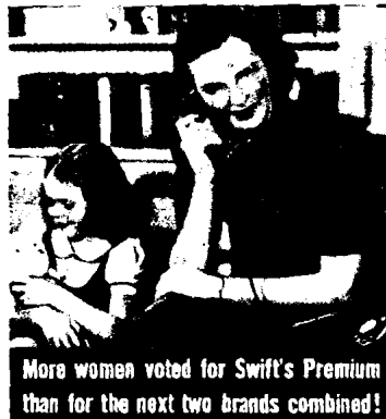
More women voted for Swift's Premium than for the next two brands combined!

FOR EASTER enjoy this ham that wins in poll after poll!