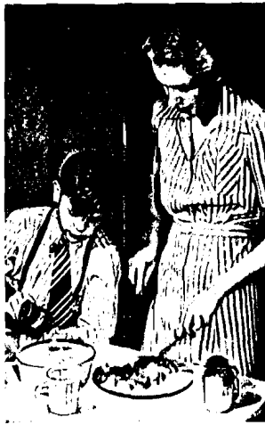
Orchard teamwork. The dish—ham scalloped with potatoes.

SNIDER PACKING CORPORATION, ROCHESTER, N. Y.