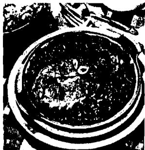
Winter victuals—a homey combination of ham and red kidney beans.