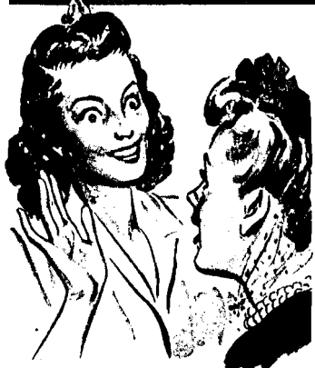
1 "PRAISE BE! AT LAST I'VE FOUND A DELICIOUS BRAN FRED LIKES. IT'S PUT OUT BY NABISCO — THE FOLKS WHO BAKE RITZ CRACKERS."