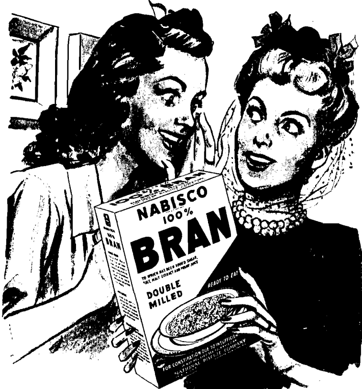
3 "YOU KNOW IT'S SUCH AN EASY WAY TO HELP RELIEVE CONSTIPATION DUE TO INSUFFICIENT BULK — AND SO EFFECTIVE."

EFFECTIVE, YES! BUT GENTLE, TOO— That's because NABISCO 100% BRAN is made by a wonderful process of Double-Milling which makes the bran fibers smaller, less likely to be irritating. And if you want a new thrill in muffins—try the grand recipe given on the package. But remember, get NABISCO 100% BRAN in the red and yellow package!