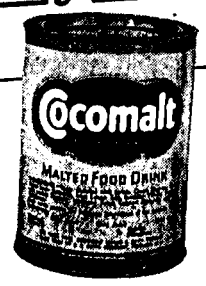
© 1947, R. B. DAVIS CO.

Cocomalt gives your child extra calcium so vital for strong bones