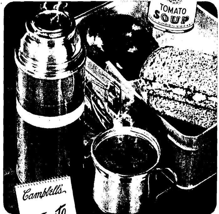
Campbell's Tomato Soup

"Almost a meal in itself." That's what Mothers call this hearty, homey soup, with its 15 different garden vegetables mingled in a rich beef stock. It's so easily digested, so packed with nourishment, so full of good taste. If the children lunch at home on school days, you could not do better than serve them Campbell's Vegetable Soup.