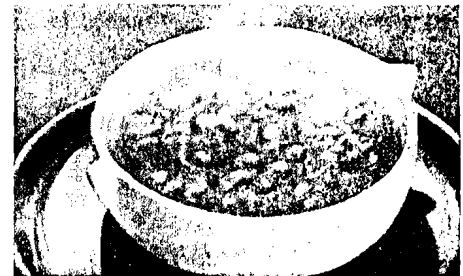
Campbell's VEGETABLE SOUP

Try this thick and hearty soup of tender whole beans. It's made extra-tempting with the tangy taste of fine bacon. You'll like it!