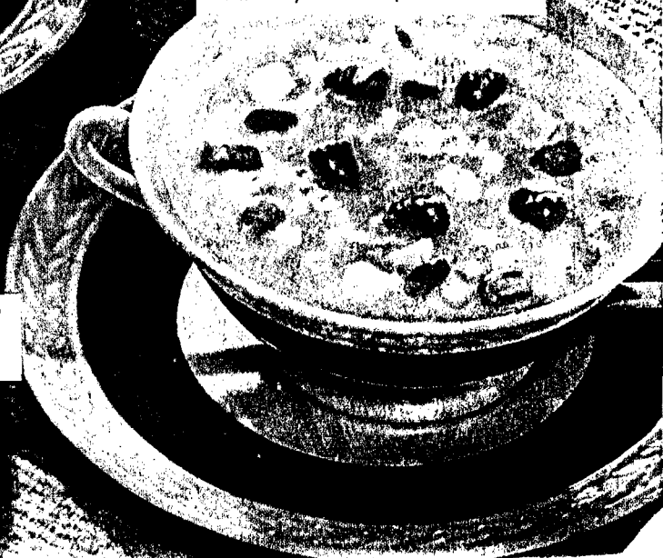
CAMPBELL'S SCOTCH BROTH A nourishing meat-and-vegetable soup with barley and tender pieces of mutton.