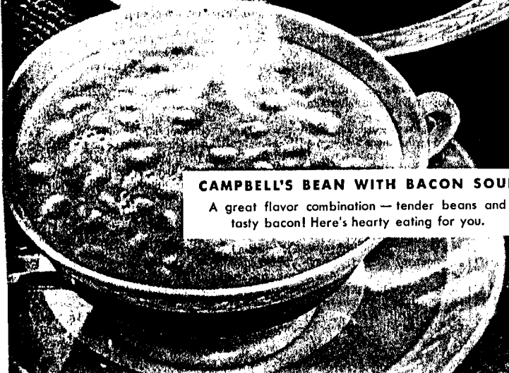
CAMPBELL'S BEAN WITH BACON SOUP A great flavor combination — tender beans and tasty bacon! Here's hearty eating for you.