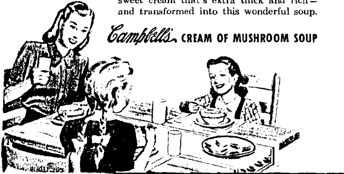
Campbell's CREAM OF MUSHROOM SOUP

For a cheerful meal, start with a soup that's festive. This soup is so particularly good because it's made with extra-special care. Tender, cultivated mushrooms are rushed from the hothouses to Campbell's Kitchens the very day they're picked, blended with sweet cream that's extra thick and rich—and transformed into this wonderful soup.