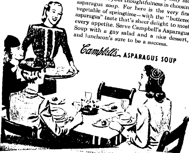
Campbell's ASPARAGUS SOUP

Girls will talk, you know—and say only nice things about your thoughtfulness in choosing asparagus soup. For here is the very first vegetable of springtime—with the "buttered asparagus" taste that's sheer delight to most every appetite. Serve Campbell's Asparagus Soup with a gay salad and a nice dessert, and luncheon's sure to be a success.