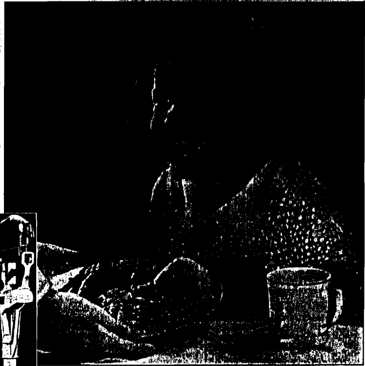
By creating the sensation of hunger, by furnishing added nourishment —Ovaltine often increases a child's weight a pound a week or more

Other: If You Have A "Poor Eater" In Your Home, Accept A Sample Package — Note The Coupon Below