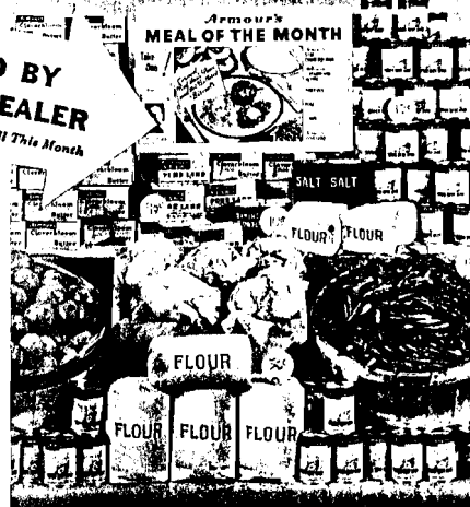
Every month Armour brings you the favorite meal of a popular celebrity

FEATURED BY YOUR DEALER Look For "Specials" All This Month