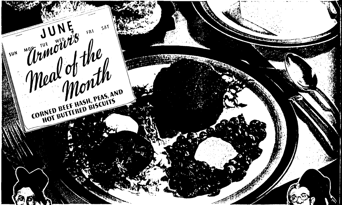
Table appointments from Marshall Field & Co.