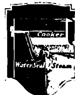
Be sure the fireless cookstove you buy has the triple seal top shown, with the famous Water Seal to lock the heat in

In addition to the famous patented Water Seal, Toledo Fireless Cookstoves have the patented Automatic Pressure Regulator to release excess steam, extra-heavy scientific insulation to conserve heat and seamless aluminum compartment lining five times the usual thickness and durability. Don't postpone an inspection of these superior features at your dealer's, go today.