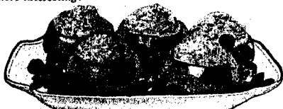
Tomatoes stuffed with Corned Beef