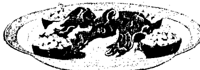
Creamed Dried Beef—Stuffed Peppers

Nowadays, just as you buy cloth all woven instead of weaving it yourself, you can buy delicious cuts of meat perfectly cooked by expert chefs. With them, meat dishes like those shown on this page are but the work of a few minutes to prepare.