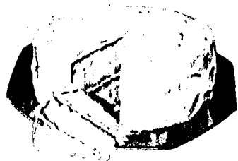
"MIGHTY NICE SUPPER—such good cake" is the verdict when you serve big soft wedges of Hostess Pineapple Layer Cake with the ices at your evening parties. The recipe is an old favorite in the Carolina plantations.

FOR YOUR PLEASURE —The Happy Wonder Bakers—on the radio every Wednesday evening. Also Frank Black and his famous orchestra. Over WEAf and the NBC network.