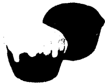
THESE GOOD LITTLE HOSTESS CUP CAKES (2 for 5¢) are just what you need for lunches, for tea time, for the children. They're frosted with either vanilla or chocolate, and it seems as though people just can't get enough of them.

FRUIT CAKE, of course, to top off the Christmas dinner—crammed full of delicious candied fruits, raisins, and rich whole pecans. Every rich crumb of Hostess Fruit Cake "tastes like old times." Packed in a beautifully decorated metal gift box, it makes a wonderful gift for far-away friends and relatives, too.