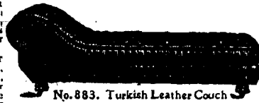
No. 883. Turkish Leather Couch Our Price, $37.00 Retail value, $55 to $60. BISHOP FURNITURE CO., GRAND RAPIDS, MICH.

WE PREPAY FREIGHT to all points east of Miss. river and north of Tenn., and allow freight that far to points beyond. Large variety of Buffets and other furniture illustrated in our large catalogue. FREE. We take all risk of damage in shipping.