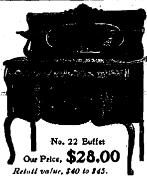
No. 22 Buffet Our Price, $28.00 Retail value, $40 to $45.