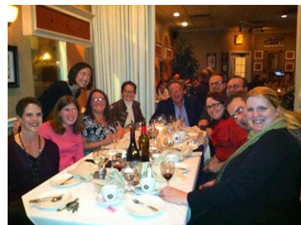
Alumni and faculty pause for a photo during their recent dinner at Tre Amici in Long Branch.