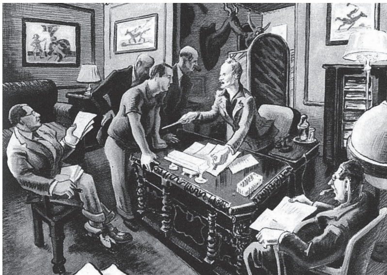
Figure 2. Thomas Hart Benton, Director's Conference , 1937. Ink wash on paper. 14 x 18 in. Courtesy of the Trustees of the Benton Testamentary Trusts, Kansas City.

With its cast of some fifty actors, directors, and blue-collar workers, Hollywood seemingly embodies Benton's vision of modern cultural producerism. Yet the barbed tone of his essay "Hollywood Journey" captures his frustrations with the movie industry's patently corporate mindset, and blatantly trivial products. The movies, Benton asserted in rather tortured text, were an "American business" solely focused on "profits." Each studio was manned by a "Hollywood Napoleon," a "boss idea man" surrounded by "yes-guys" in an executive office no different from "your banker or stockbroker friend in New York, Chicago, or Kansas City." In a "Hollywood Note" titled Director's Conference (Figure 2), Benton sketched Fox boss Zanuck—"the little fellow behind the big desk . . . an American business Napoleon"—during a story conference with studio producers, directors, and writers. 12 Such a meeting was not, said Benton, "a conference of artists . . . engaged in the simple business of finding a vehicle for the expression of their life experiences." Rather, the movie industry was "like the stock market," making "plays for a cash return" ("Hollywood Journey," 4-6, 8).