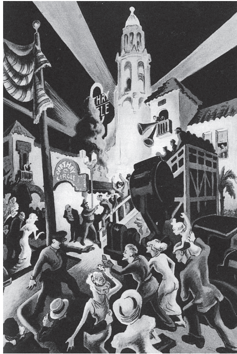
Figure 3. Thomas Hart Benton, Carthay Circle , 1937. Ink wash on paper. 10 x 13 in.

Benton captured a similar scene of crowd frenzy in “Carthay Circle,” a drawing from his “Hollywood Notes” series that depicts policemen trying to control a manic mob of fans at a movie premiere (Figure 3).