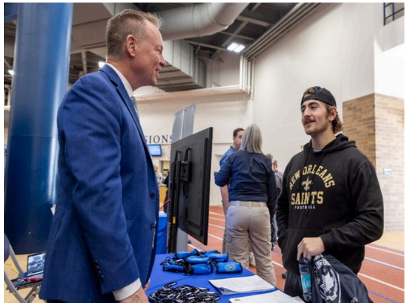
STUDENTS NETWORK WITH LAW ENFORCEMENT PRACTITIONERS