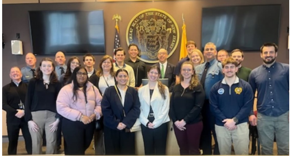
STUDENTS AND FACULTY AT THE NEW JERSEY STATE POLICE REGIONAL OPERATIONS INTELLIGENCE CENTER