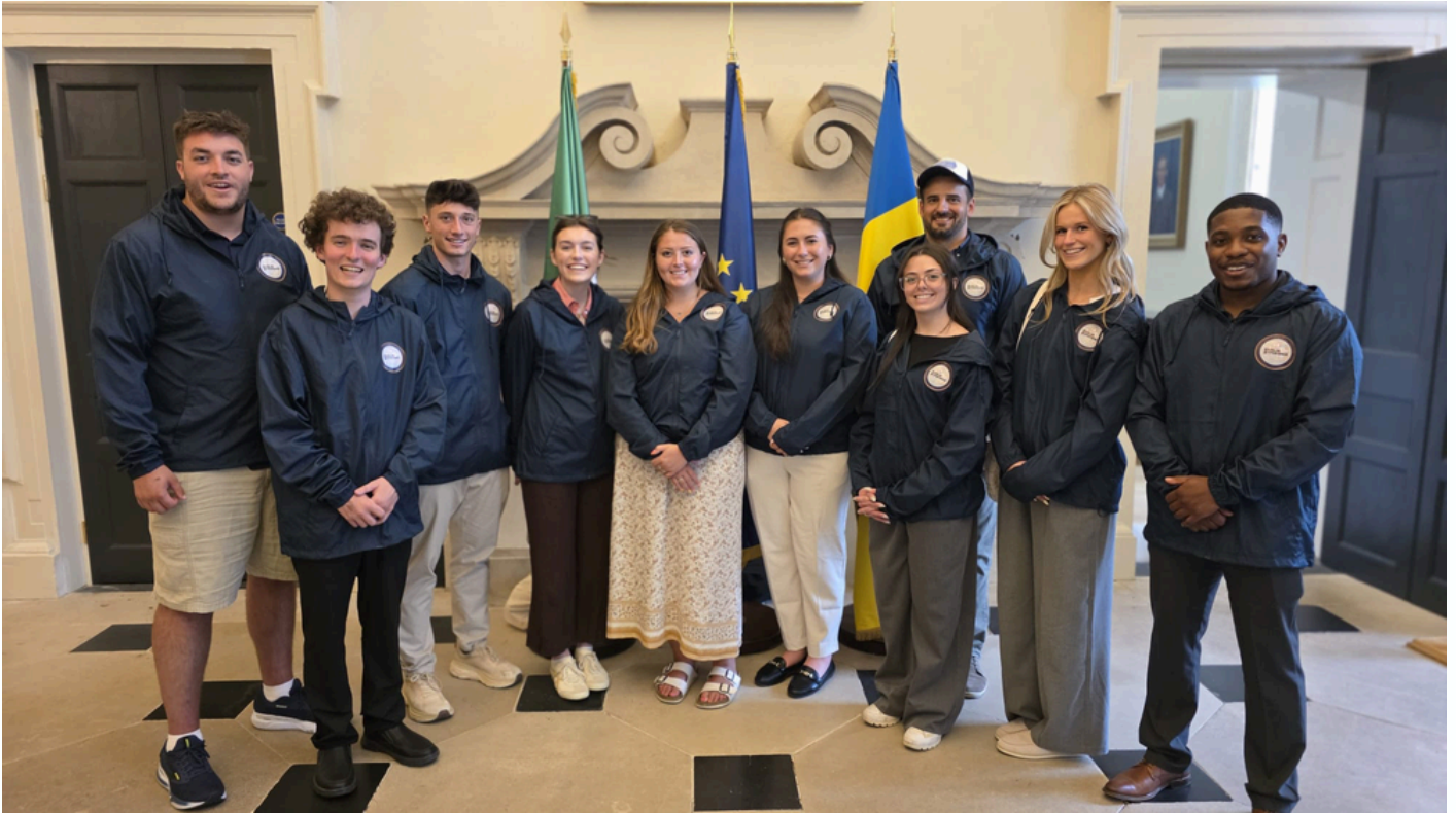
STUDENTS IN CJ 582 AT LEINSTER HOUSE, PARLIAMENT OF THE REPUBLIC OF IRELAND