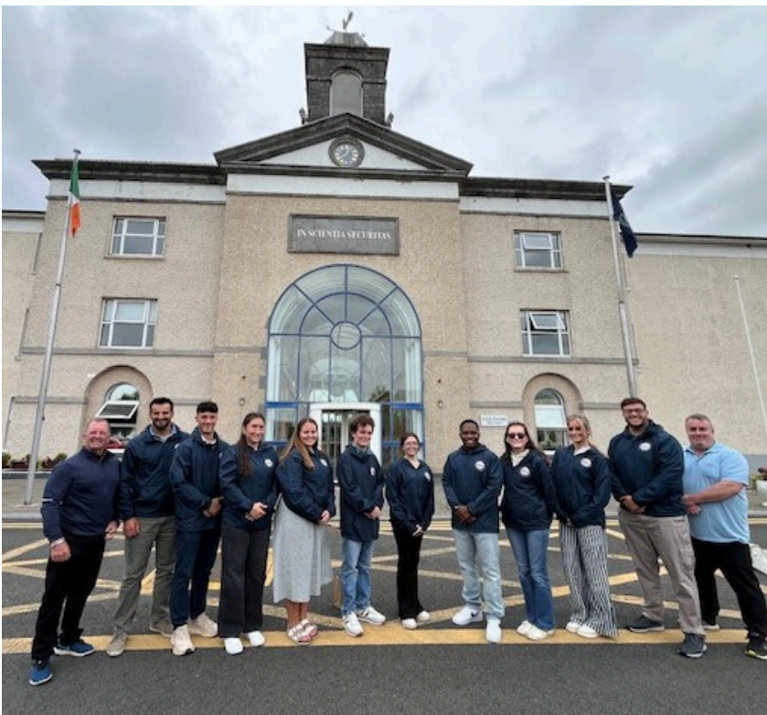
THE CLASS VISITS THE GARDA COLLEGE AT MCCAN BARRACKS, TEMPLEMORE