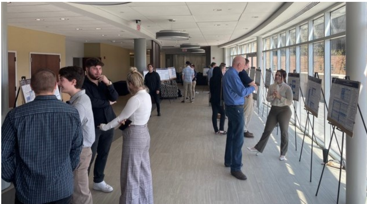
Students and faculty attend the Senior Seminar Poster Presentation Event