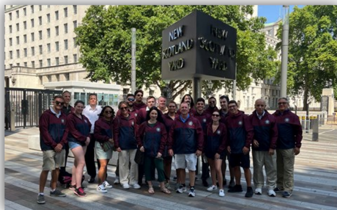
The Class Meets with Officials at New Scotland Yard