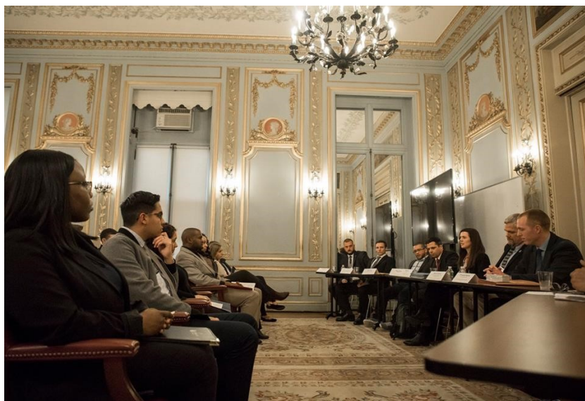
Students listen as panelists discuss their careers and provide advice for students who are interested in obtaining positions with their agencies.

Many students consider this event to be the most valuable of the year and several former undergraduate and graduate students credit this event with providing the initial contact for future positions that they have obtained.