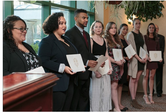
New members of the Alpha Phi Sigma Honor Society are inducted.

On April 20, the Department of Criminal Justice held its annual awards ceremony to recognize the exemplary work of its students and to induct new members into the Alpha Phi Sigma (CJ) and Omicron Sigma Sigma (HLS) honor societies. Faculty, students, administrators, and family were in attendance to show their pride for the recipients. Students receiving individual departmental awards are shown below.