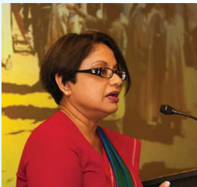
USG Coomaraswamy speaking in Wilson Hall

Monmouth University, through IGU, hosted the inaugural lecture in the annual United Nations Academic Impact (UNAI) Lecture Series this fall, featuring Under-Secretary-General Radhika Coomaraswamy, Special Representative of the Secretary-General for Children and Armed Conflict. A highlight of the lecture was