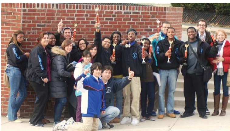
The Asbury Park High School Debate Team proudly displaying their trophies after their win in Baltimore