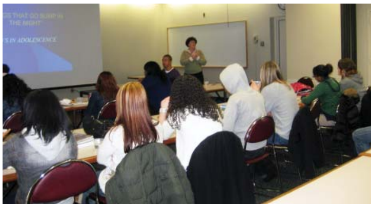
Project BAM Careers in Healthcare session

Project BAM is part of the United Nations Academic Impact (UNAI) initiative. IGU's partnership with UNAI enables the Institute to promote and align its projects with the UN to enhance educational opportunities, human rights, and intercultural exchanges in local and global communities.