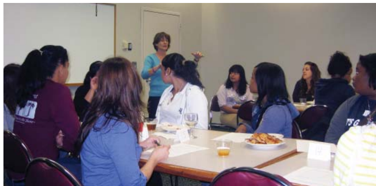
Project BAM Kickoff session