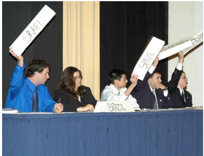
Participants from the Model United Nations Session at the 2007 Convention.

Schultz, T.W. (September 1963). Book review of The Production and Distribution of Knowledge in the United States . By Fritz Machlup. Princeton: Princeton University Press, 1962. The American Economic Review , 53(4), 836-839.