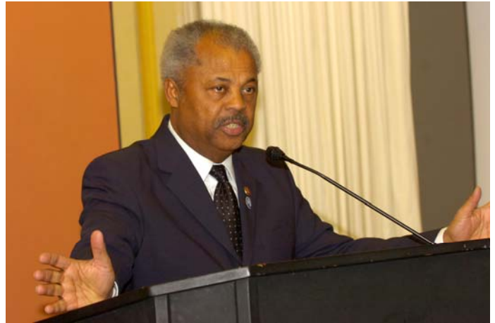
Congressman Donald Payne, addresses audience at opening of Global Understanding Convention, 2007.

We must stop thinking of poverty as an abstract issue, and generate new solutions that work. The majority of people on the continent of Africa live in poverty. Trade can be the key that opens the door to international development for many developing coun-