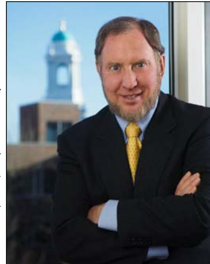
Robert Putnam addresses the decay of community-based society in his book, Bowling Alone.

Later in the academic year, the students will have the exciting opportunity to talk to Putnam himself. Putnam will be visiting the University to speak about his work on January 27 at 2:30 pm in Wilson Auditorium.