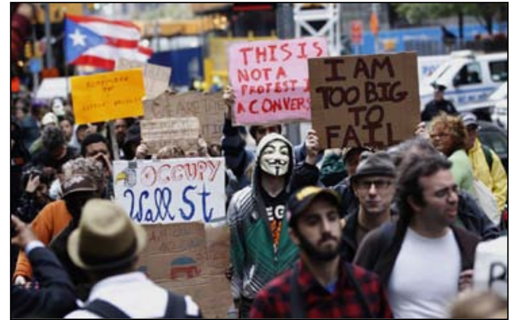
Protesters in Occupy Wall Street take to the street to speak out against economic inequalities.

Some citizens are angry about the protestors' actions while others have favorable impressions of the