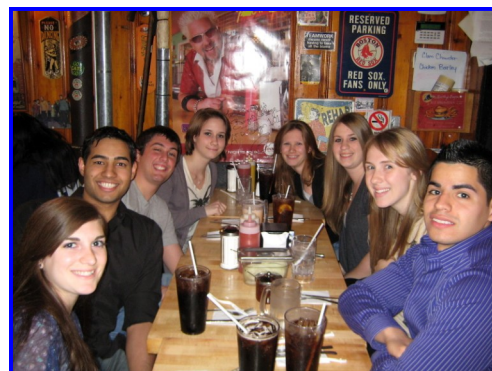
Students enjoying dinner in Cambridge

The Psychology Club's big plans for the coming school year involve more work with The Boys and Girls Club, as well as continuing to fundraise for charity. Their new executive board is very excited to continue the tradition of helping others.