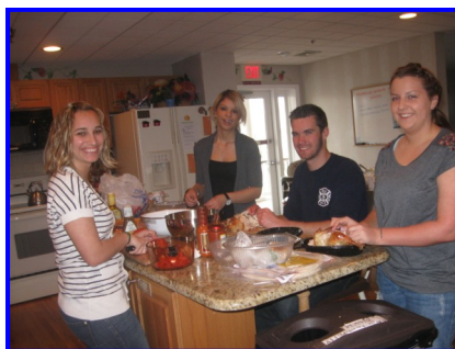
Psi Chi Students at the Ronald McDonald House this April

Psi Chi had a great spring semester inducting 40 new members into our international honor society. The following week we used the money that has been raised from fall semester to allow us to cook for two Meal Maker Nights at the Ronald McDonald House of Long Branch. New members, along with old members and faculty, went to the house to cook dinners for the guests who are using the services provided during their difficult times. We had a great experience and are looking forward to doing it again next year! We also had a successful Old Monmouth Candy Sale. We raised over $500 for the Ronald McDonald House! Thank you to all who sold and supported the sale.