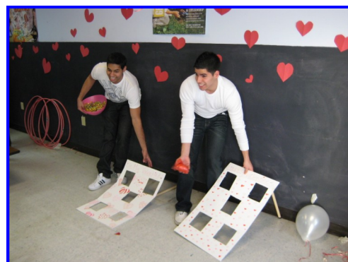
Playing games at the Boys & Girls Club Party