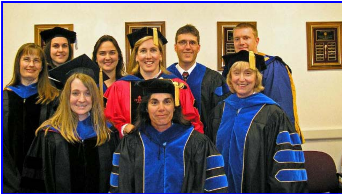
Psychology Department Faculty before Founder's Day 2008